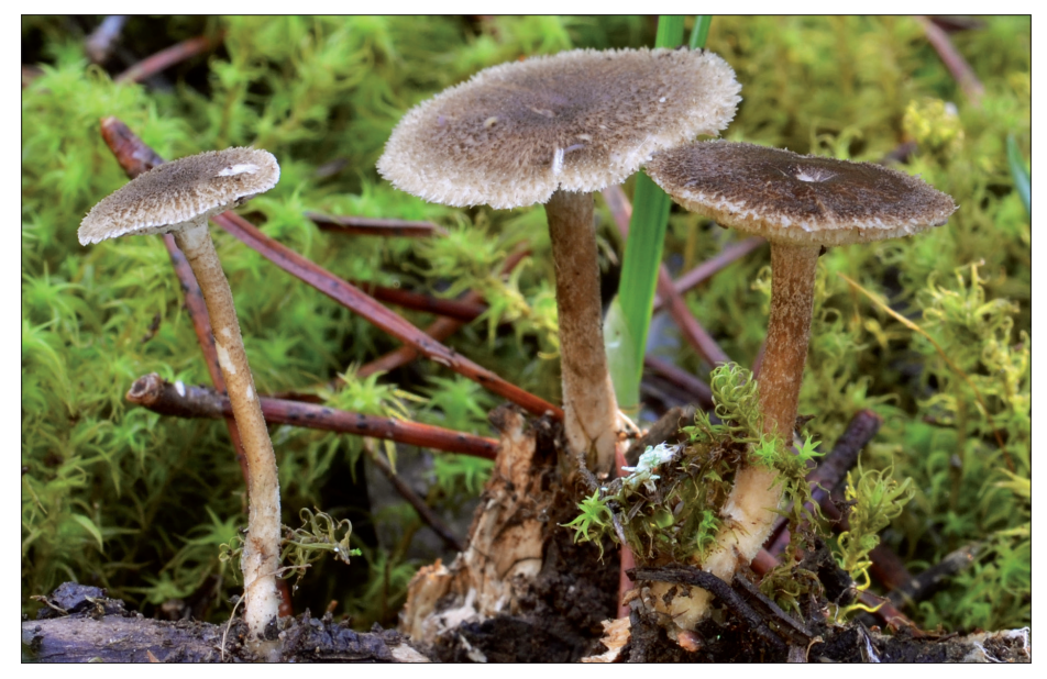
Figure 555 - Polyporus meridionalis (C. Agnello).

Remarks – The small size of pileus, the growth on buried wood in Mediterranean macchia are distinctive characteristics of this species.